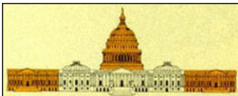
West Front - Bullfinch's Dome and central addition gave Congress's home this look from