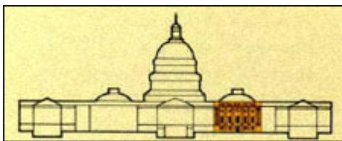
East Front - Box-like Wing of the old Capitol, first to be completed, served Senate, House and Supreme Court.

List the order in which the U.S. Capitol was built: