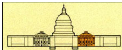
West Front - The tinted section in the sketch depicts the House wing occupied in 1807.