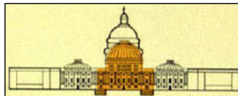
East Front - Dome and Wings added to the Capitol in the 1850's and 1860's brought the